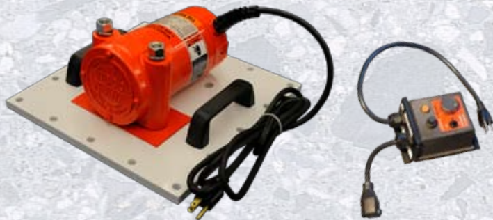
US-450T, UMC-1 & SPC controller