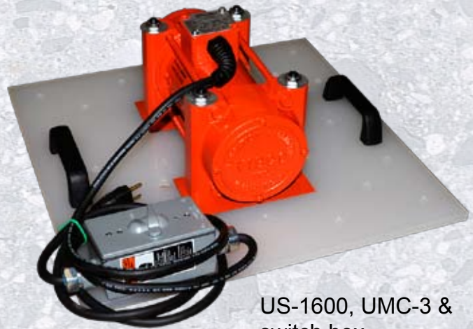
US-1600, UMC-3 & switch box